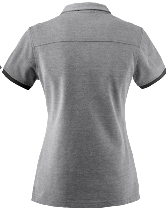
BLACK - BACK VIEW

1: Button-down collar. | 2: Contrast lining inside collar, and contrast ribbing at cuffs. | 3: 100% compact cotton, 250 g/m2