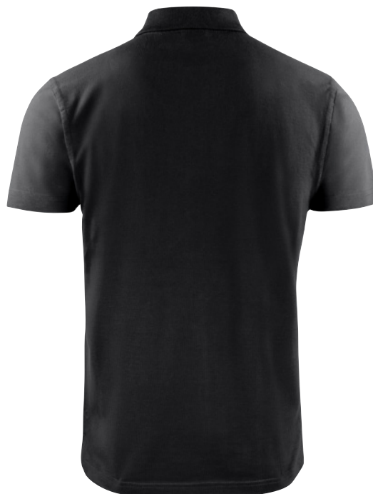
BLACK - BACK VIEW