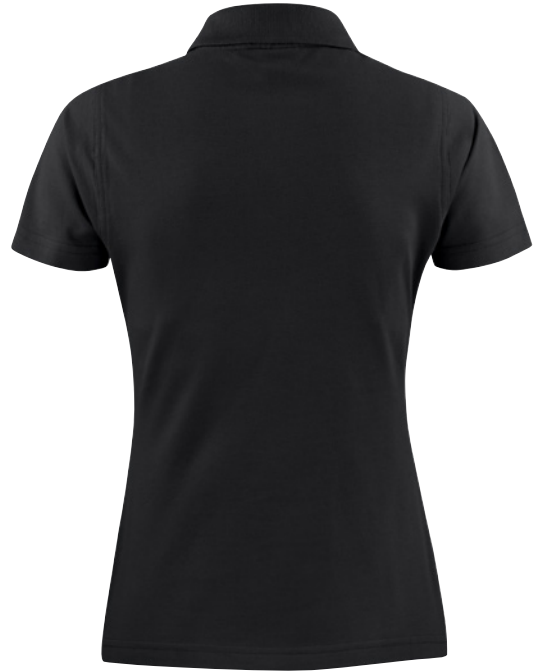
BLACK - BACK VIEW